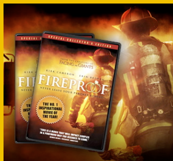
SAY "I DO"... ALL OVER AGAIN! THE NO. 1 INSPIRATIONAL FILM

Around 130 people came to enjoy Dinner & a Movie. Thanks for making this OUTREACH a success.