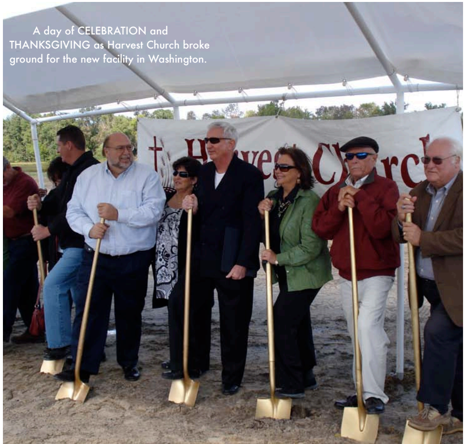
A day of CELEBRATION and THANKSGIVING as Harvest Church broke ground for the new facility in Washington.